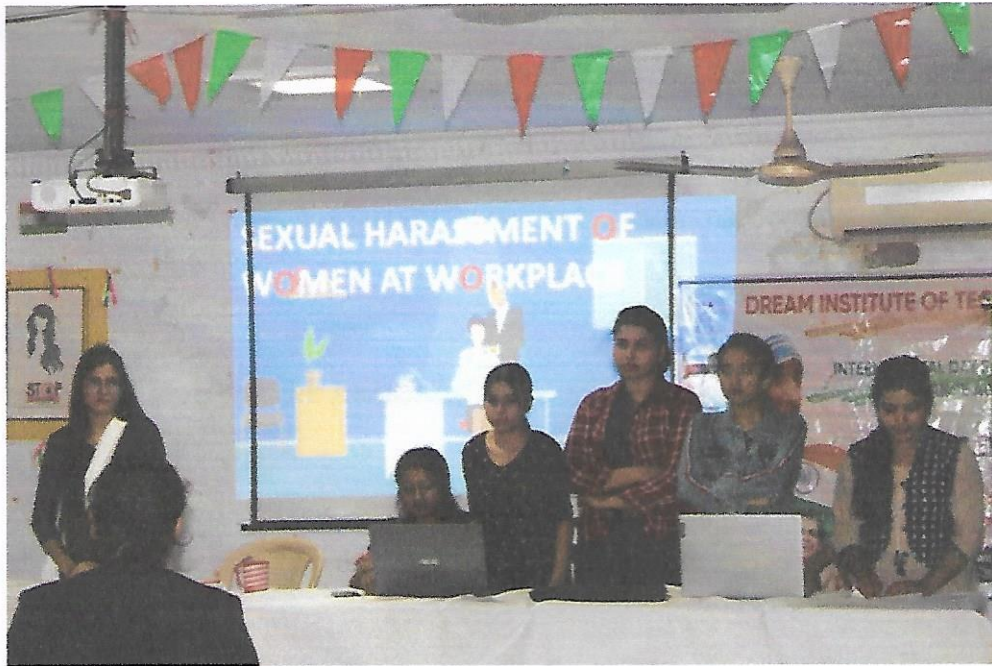
Drama performed by girls

The Program was ended by vote of thanks to Program Convenor.