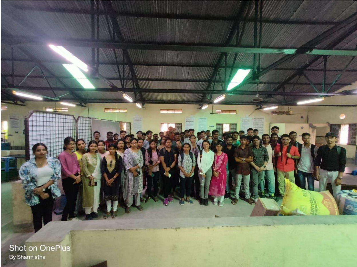
Shot on OnePlus